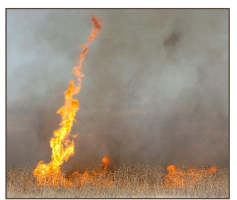
Dangerous weather conditions can cause fire whirls to form. Like tornadoes, fire whirls vary in size — from less than one foot in diameter to several dozen feet wide.

Grass and brush fires on our East and West Mesas are fast moving. They will often stop spreading when they reach a road, a plowed field or grass that has been sprayed with water. Escaped field fires in the valley that get out of control threaten many values and can extend into bosque.