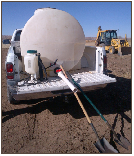
Be sure you have enough people, equipment and water to put out the fire quickly if you need to.