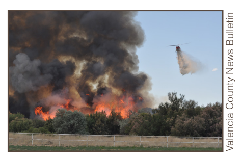
Information about current wildfires and prescribed burns in New Mexico can be found at this website: http://nmfireinfo.com