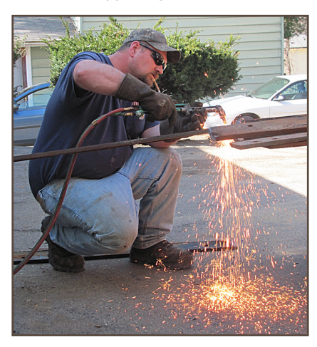
Welding ~ Hot pieces of metal are easy to see when they are glowing, but stay hot enough to start a fire after they darken. Be sure that sparks can't get lodged in brush, hay, wood piles or soil that might be moist with fuel or oil.

Sparks and hot materials are natural byproducts of welding, cutting, grinding and operating equipment. There is nothing wrong with these things unless they give birth to a brush fire. Here are some tips to keep that from happening.