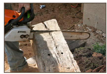
Cutting ~ If you are cutting material that might contain nails make sure that the sparks will hit open ground away from brush or piles of sawdust.