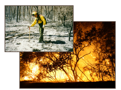
Stable Fire in the bosque, June 2010

When a big plume of smoke climbs into the sky one of two things is probably on fire: the dense cottonwood forests in the bosque, or grass and brush in more open terrain. Each has its own special dangers, especially when warm weather and spring winds arrive.