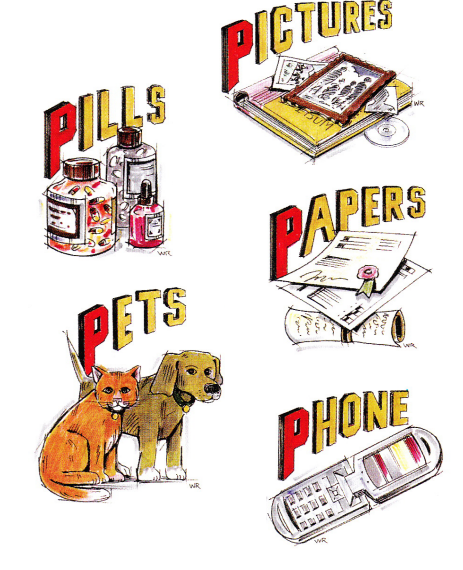
More information about caring for pets is at www.apnm.org/disasterplanning

Leaving the house ~ Put on cotton clothing with long sleeves, plus boots and gloves. Before you leave, close all windows and all doors into garages, barns and sheds. Close the windows of any vehicles that you will leave behind. Turn off ventilation fans in the house. Close the valve on the propane tank. Turn on all outdoor lights. If you have time to set up a sprinkler, have it spray vegetation next to your home.