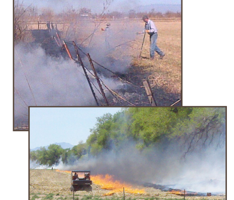
Controlled burns ~ When burning fields, ditch banks or fence lines, it is always safest to ignite the fire so that it can only burn against the direction of a very light breeze. Most fires escape because they are left unattended or the winds increase in speed or change direction.