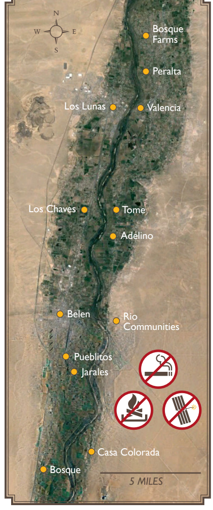
Almost all of the communities in Valencia County directly benefit from the bosque that lines the shores of the Rio Grande.

The Wildland Team of the Valencia County Fire Department is working with NM State Forestry and MRGCD in the Jarales bosque to remove non-native trees and brush such as Salt Cedar and Russian Olive trees. The Fire Department is taking a proactive approach to lessening the severity of catastrophic wildfires in the bosque.