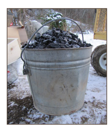
Wood stove ashes ~ Here is a recipe for the safe disposal of ashes: