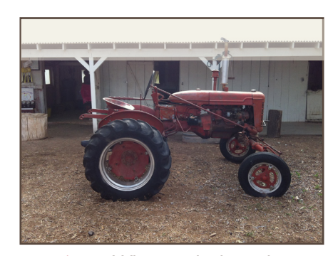
Parking ~ Where is the best place to park your cars and equipment? The answer is on concrete, dirt or gravel. This way any hot engine parts can't ignite tall grasses. Plus, your vehicles will be safe from a fast moving grass fire.