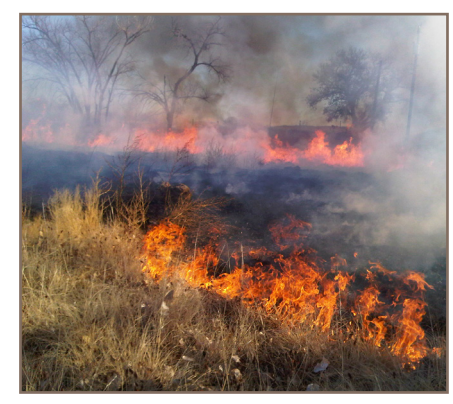
Homestead Fire, December 2013

A wind-driven fire in thick grass can spread faster than you can run. Because of this, grass fires are the most dangerous type of wildfire. A slight change in the direction of the wind will immediately affect which direction the fire spreads. An unpredictable fire like this is very dangerous for firefighters, residents and livestock. The thick smoke from a big grass fire can reduce visibility so much that you can't drive safely or even know where the fire is located.