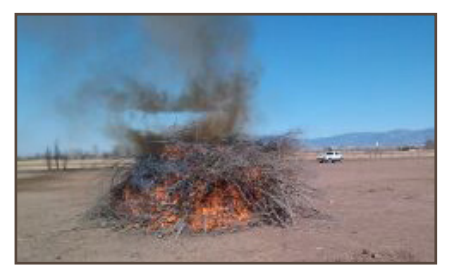
Burning brush ~ What are the two biggest mistakes you can make when burning brush?