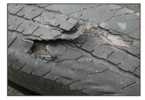
Driving ~ When tires look like this they can become a fire hazard. Each year fires are started when very hot pieces of a disintegrating tire land in dry grass next to a road.